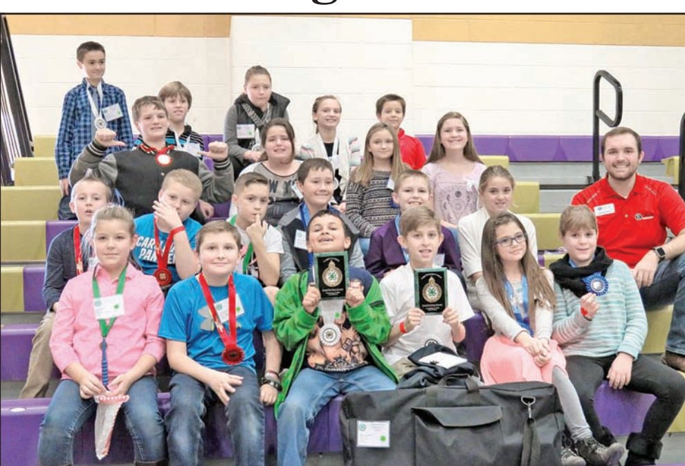
This year, Towns County 4-H took more kids to District Project Achievement than ever