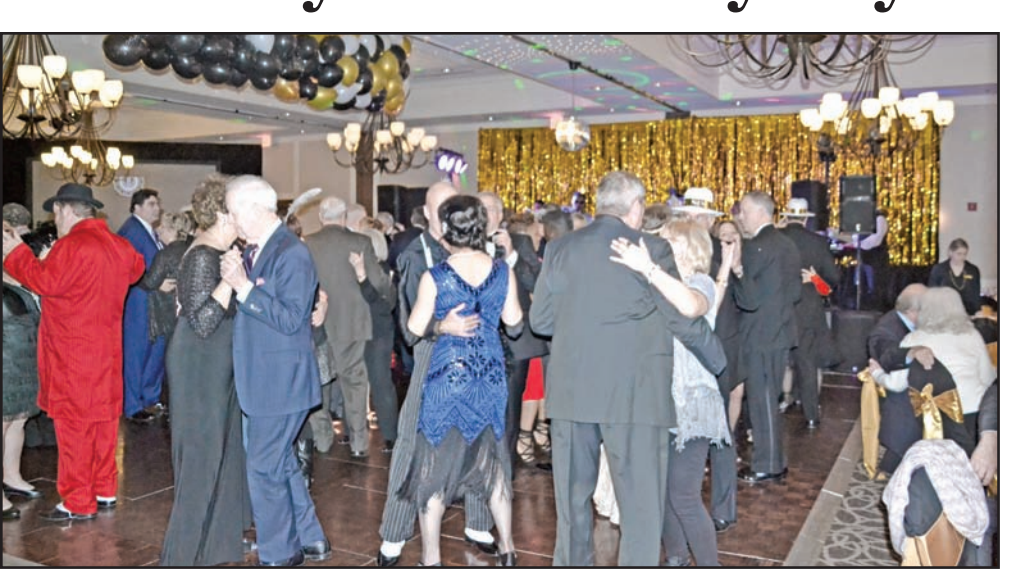
Gala patrons danced for hours on end, carrying themselves on fleet feet into the new year. See Gala, Page 6A